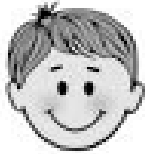
(E) Boy w/ Straight Hair