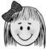
(B) Girl w/ Straight Hair