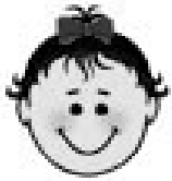
(A) Baby Girl

Bows are an additional charge. See chart to the right.