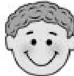
(F) Boy w/ Curly Hair