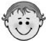
(D) Baby Boy